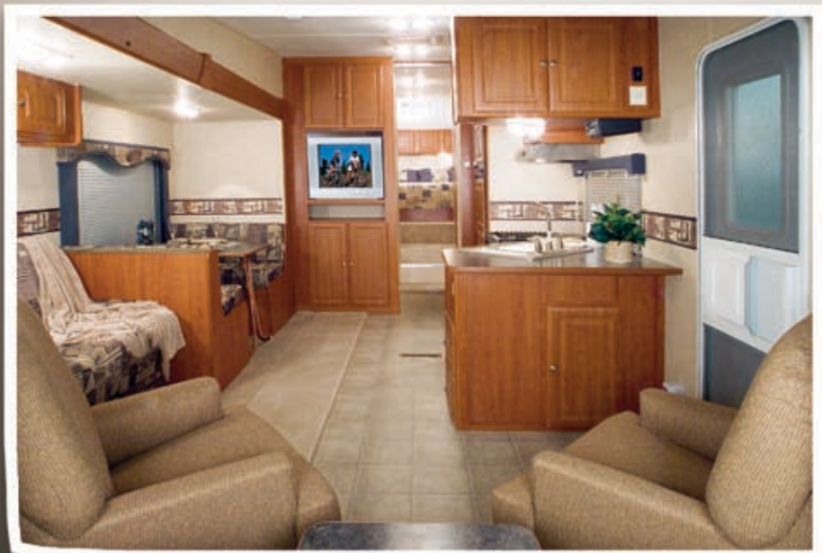
TC527RL — Camilla Moss Interior