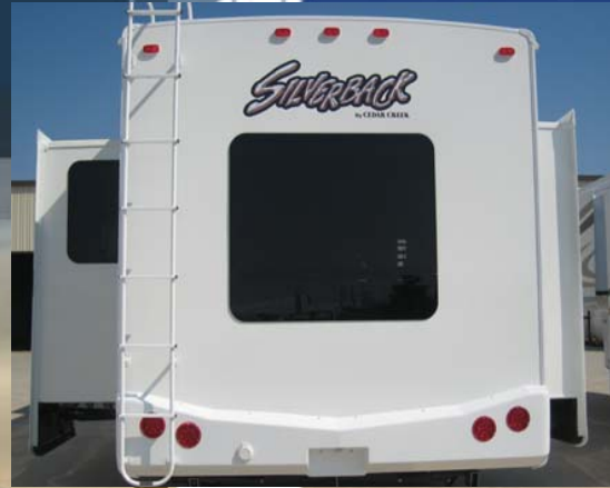
NEW MOLDED LOWER REAR CAP Stylish look with new LED taillights

No exterior frames for clean look, better seal Deep tint safety glass for privacy, comfort and protection