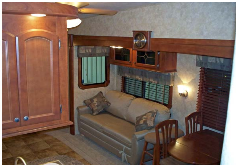
Photographs of New 32WRL