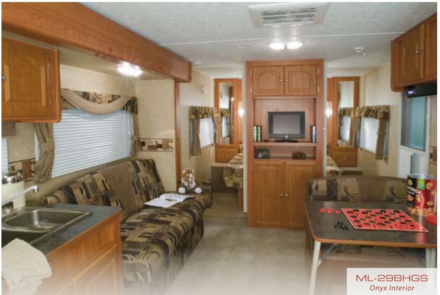
ML-29BHGS Onyx Interior