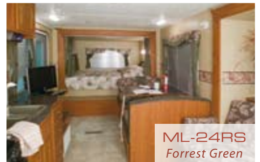
ML-24RS Forrest Green