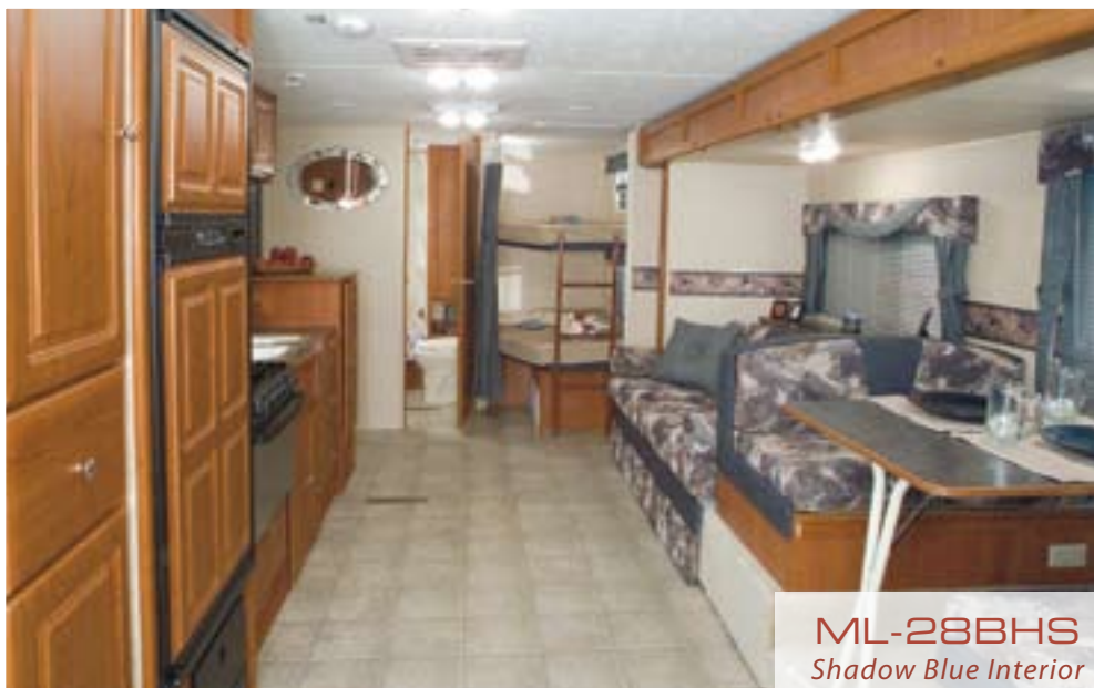
ML-28BHS Shadow Blue Interior