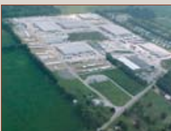
Our 58 acre complex in Warsaw, Indiana

"Quality Features for the Best Value in the Market"